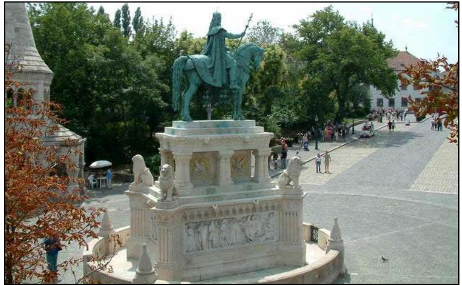
CISTM11. Budapest, Hungary. May 2009. Start Planning!