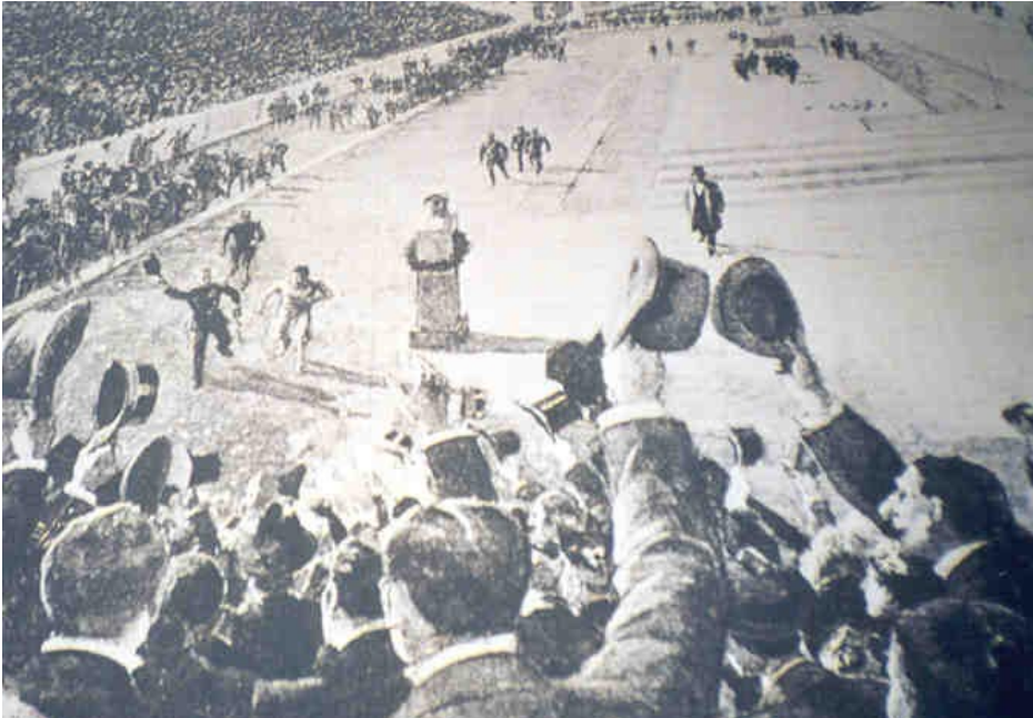
1896 Olympics, Athens: (The winner of the first marathon of the Modern Olympics)